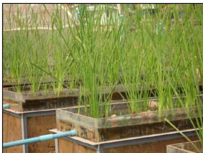
Figure 1. Experimental units of the study

In the second phase of the study, the effect of plant harvest interval on the metal removal was investigated. Based on the result of the first phase of the study, each CW system was operated with a selected HRT and groundwater was continuously fed into the treatment units. Plant harvest was carried out at intervals of 4, 6 and 8 weeks. Before CW system start up, all plant shoots were cut at 20 cm above the soil surface. Throughout the experimental period, shoots were