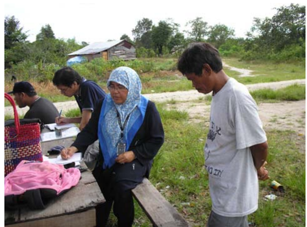
Plate 2: Interview with Tok Batin representative of Kampung Selingkong

In addition, recent logging and land conversion to agricultural purposes in the areas also contributed another wave of impacts on their forest resource-based livelihood (FRIM, 2004). These impacts were much greater in Kampung Selingkong and Kampung Meranti. Due to forest resources declining which they once highly depend on, they were unable to generate income used to be and getting food sources easily from the forest. From their responses, “Nowadays to earn RM10 in a single day is so difficult” and “Nowadays, everything needs to buy. Not like the old days. Having small amount of money also not a big deal” had shown their difficulties in generating cash income from the forests. Additionally, some of them felt the change of their