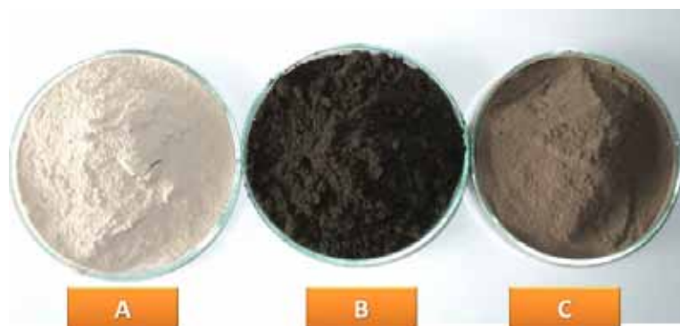
Figure 3. The features of fresh bleaching earth (A), Spent bleaching earth (B), and Reactivated bleaching earth (C)

as an adsorbent. The deoiled spent bleaching earth may be reused in bleaching, either directly or after activation with acids (Alhamed and Zahrani, 2002). In this study, the deoiled SBE was reactivated with HCl. Activation is a treatment of the adsorbent aiming at enlarging the surface area by breaking hydrocarbon bonds or oxidize the surface molecules, so that enlarging the surface area and the effect on the absorption (Alhamed and Zahrani, 2002). The positive selection of dry washing is possible when a large amount of soap is present. The water washing causes emulsion problems, whereby the fatty acid esters, such as fatty acid methyl esters, will not separate from the water. In addition, water-washing does not eliminate effectively some of the other contaminants, such as sulfur, phosphorus, and any remaining free fatty acids (Abrams, 2009).