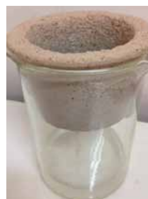
Figure 1. Design of clay-pot water filter