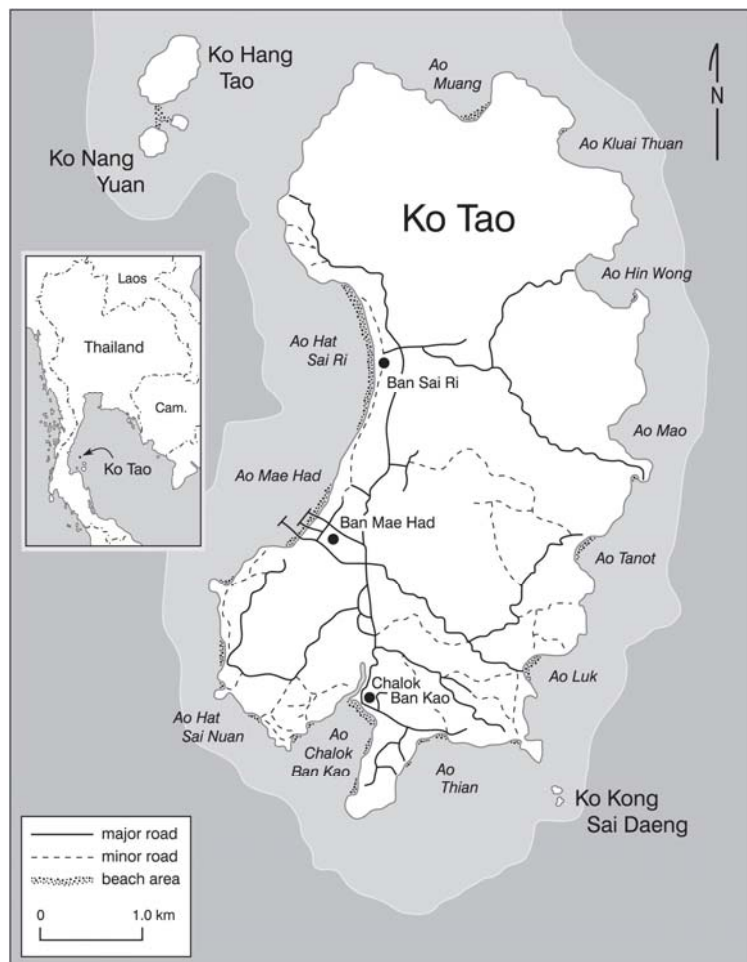
Figure 1. Koh Tao study area

The island is dominated by granitic hills that rise up to 379 m above sea level and a coastline containing small bays and coves separated by rocky granitic headlands (TISTR, 1995). Due to its relative isolation in the Gulf of Thailand, Koh Tao was uninhabited until the early 1930's when the Thai government incarcerated political prisoners on the island. Use of the island as a prison was discontinued in 1944 and the first settlers arrived in 1947 when fisherman and farmers arrived from the nearby islands of Koh Phangan and Koh Samui. These early settlers and their descendants lived in relative isolation for forty years until the